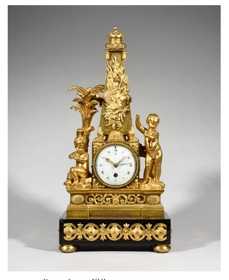
PARIS, LOUIS XVI PERIOD, CIRCA 1775